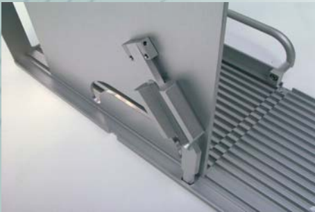
Integrated automatic lock system to prevent film frames from slipping out of the cassette during transport