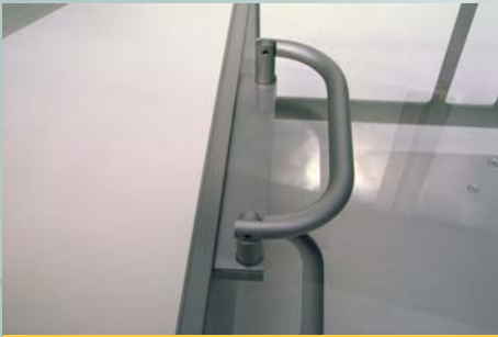
Two retractable human handles, full wrap-around grip